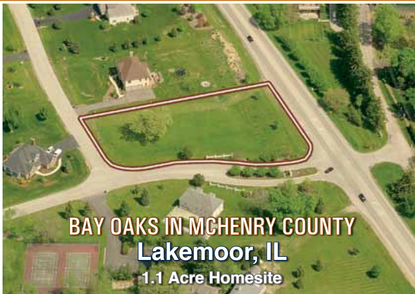
BAY OAKS IN MCHENRY COUNTY Lakemoor, IL 1.1 Acre Homesite